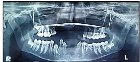
Fig 3: Panaoramic radiograph